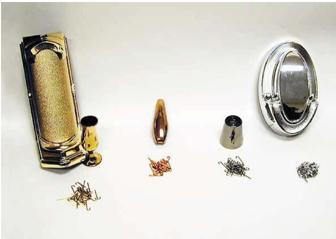
l to r: aluminum bronze, silicon bronze, nichrome, aluminum

When we consider gold toned alloys, the first two categories of material that come to mind are brasses and bronzes. Brasses are alloys of copper and zinc, and sometimes lead in varying ratios. Bronzes are alloys of copper and tin perhaps with additional elements such as phosphorus, manganese, aluminium, or silicon. At a vacuum of 10^{-4} torr, copper evaporates at 1017^{\circ}\text{C} , tin evaporates at 997^{\circ}\text{C} , and zinc at 250^{\circ}\text{C} . This tells us that if we evaporate brass, the zinc will evaporate first, and will then be covered by a layer of copper. This is not what we want and will result in a coating that is silver colored on one side and copper colored on the other. Additionally, any amount of lead in the vacuum chamber should be avoided due to toxicity issues. Bronze is a better choice since the evaporation temperatures of copper and tin are close. With careful execution, it is possible to have both the copper and tin evaporate together, giving a gold colored result. The other metals that can be present will have an effect on wetting, evaporation, and coloration. Silicon bronze deposits with a brownish copper color. Aluminum bronze is a better choice for gold colors. Midwest Tungsten Service sells both.